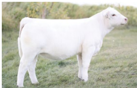
PCC 71H, daughter Purchased by Caprock Cattle Co for $12,000