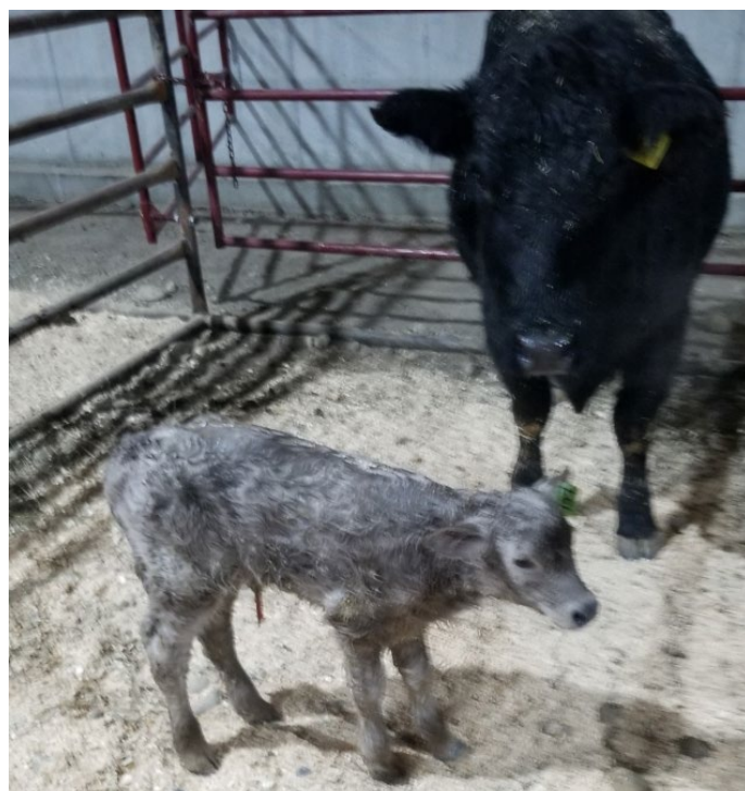
The Silver advantage on display at Cluny colony out of PCC bulls

Long, long, long, you want to add length of body this is your bull, curly hair and great headed. This bull is a full sib to the high selling female in the sale this past fall that went to Cays Cattle. The ultra popular Lot 14 female was a popular pick by many. PCC OAKLAND 20H is a performance bull that fits the mold of many of the bulls the Cluny Colony has bought over the years. Cluny Colony rings the bell every year with the top calf prices at the Strathmore Market.