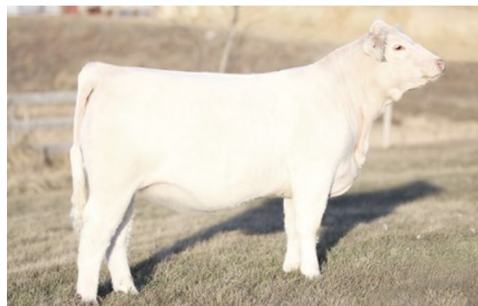
This LT Landmark 5052 daughter was a high seller in the Miss Prairie Cove female $18500.00 to our great friends at DanG Charolais.

As you search for a herd bull to put in your heifer pen. Look at PCC Lincoln 15H. Combine an award-winning female Lily with a proven calving ease sire in Landmark and expect great things. His very smooth front end still comes with some length and performance. Watch for a super uddered, stylish two-year-old Landmark daughter at Dang Charolais this year when they hit the show road.