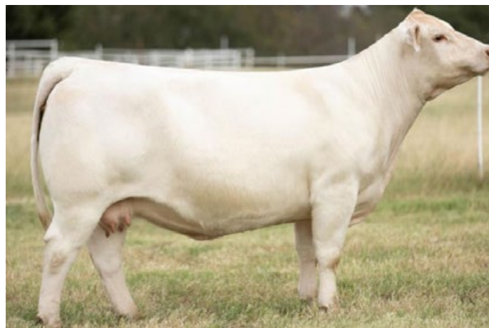
Dam of Lot 10

The first Rhinestone Cowboy sired bull to sell in Canada, and he doesn't disappoint. He hits you hard when you first see him with tremendous muscle, and a big top. He comes in a moderate package and a nice comfortable birth weight, this extra age bull will cover more miles out on pasture with lots of cows. This genetic outcross is a great option for seedstock producers as this bull is high quality and offers a unique twist with his pedigree.