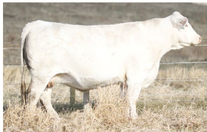
Dam of Lot 13. Purchased by Pro Char Charolais in the MISS Prairie Cove Female Sale

One of the powerhouse Fireball sons that was one of the heaviest bulls at weaning. We love the guts, hair and the look that the Fireball bulls have this year. Fireball is a homozygous polled with extra performance and big EPDS for weaning and yearling. Raising sons that look like Fireball will put money in your pocket.