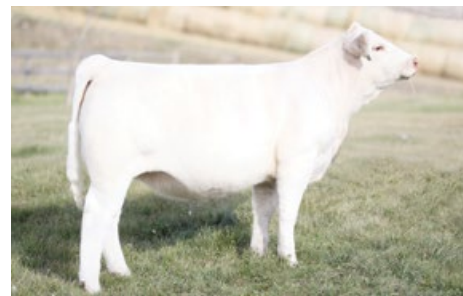
PCC 60H, daughter Purchased by Clear Water River Charolais for $17,000