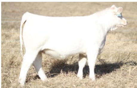
PCC 46H, daughter Purchased by Tyler Young for $6250