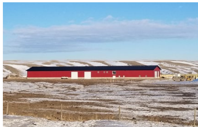
New calving barn at the Cluny Colony

A very long spined Fireball son out of one of our top females. We purchased Beyonce' as the pick of the Sylvan Marten herd at Agribition. Her first calf at PCC was the many times champion PCC Rome who has made a big impact on the Charolais breed. Pick your next herdsire from a pedigree backed with some of the top animals in the entire breed.