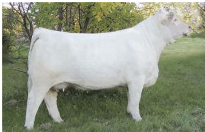
Miss Prairie Cove 309A, dam of Lots 20-24

Power in the blood, Herdbull from every angle; great character in his head, so square up over his hip and top.